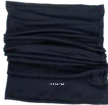
*Beanie and neck-warmers are the same shade of navy. Picture's are not exact.